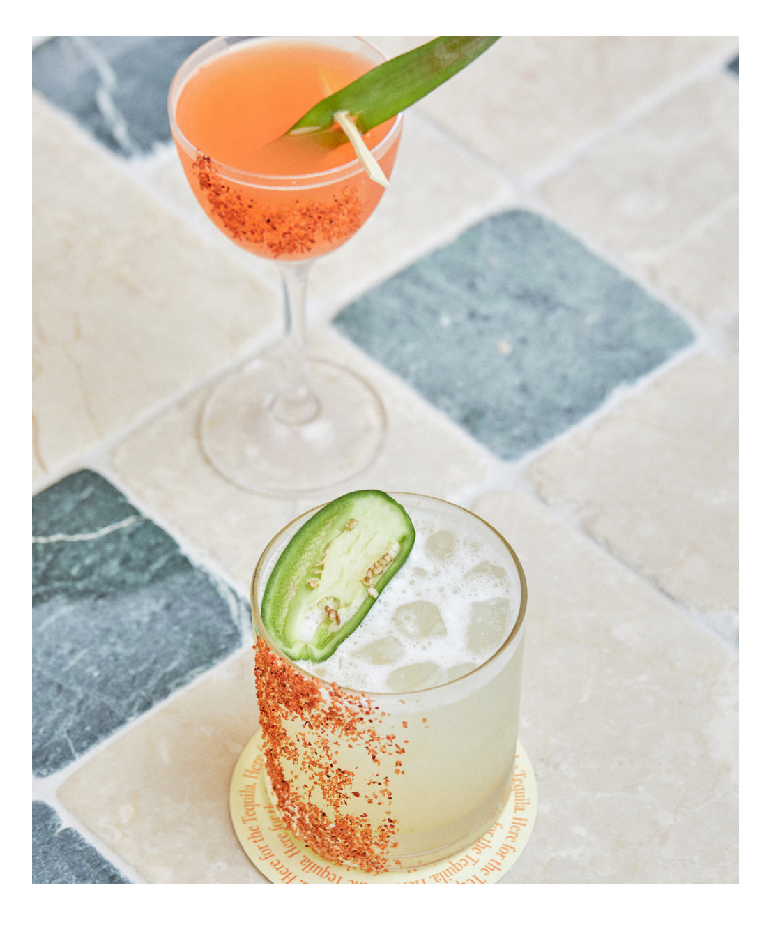
16 Barrenjoey Rd, Mona Vale NSW 2103